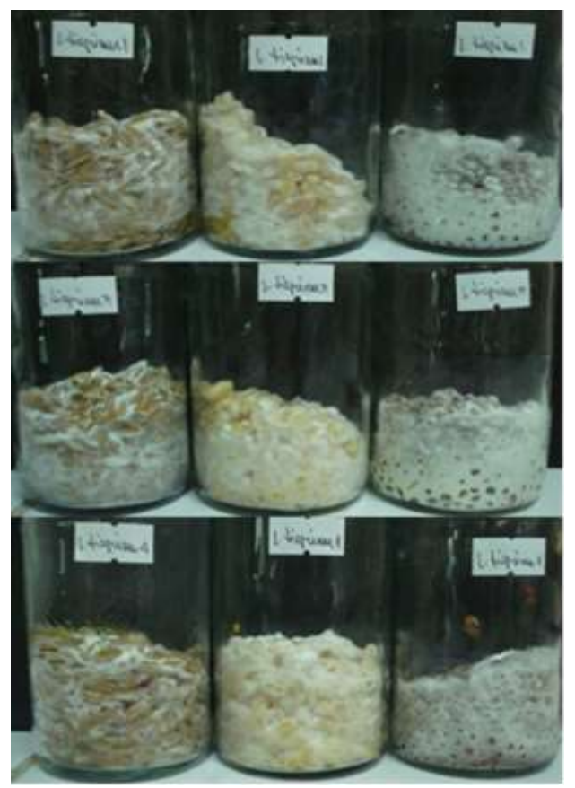
Fig. 2. Mycelial colonization on the different spawning materials: L. tigrinus strain ZB12MF03:(A) unmilled riceseeds, (B) corn grits seeds, (C) sorghum seeds; L. tigrinus strain ZB12MF05 (D) unmilled riceseeds, (E) corn grits seeds, (F) sorghum seeds and L. tigrinus strain

However, the results in this study means that L. tigrinus mycelia efficiently grew in any type of grain spawning materials so it would be easy to propagate the mycelia of this mushroom for mass production. Still these findings contradicts the report of Dulay et al. (2012) where they reported that the incubation period of L. tigrinus was significantly affected by the spawning materials used. Dulay et al. (2012) reported a 5-day incubation period for unmilled rice seeds as compared to our reported 7-day incubation period for all the evaluated grain spawns. Perhaps, different strains of similar species of mushrooms exhibited different mycelial growth on various substrata. Similar observation was reported by Visscher (1989) wherein different strains of king oyster mushroom ( P. eryngii ) responded differently to different substrates, supplements, supplementation amount, and environmental factors in relation to mycelium run, average mushroom yield and quality.